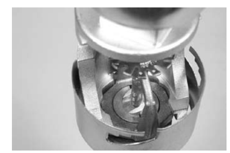
CORRECT ENGAGEMENT FOR MODEL V36 CONCEALED/RECESSED WRENCH