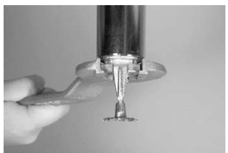
CORRECT ENGAGEMENT FOR MODEL V36 OPEN-END WRENCH