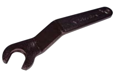
MODELS V34 & V36 OPEN END (USED WITH MODELS V34 OR V36 SPRINKLERS)