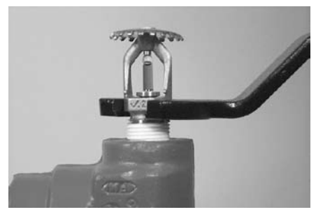
CORRECT ENGAGEMENT FOR MODEL V27 AND MODEL V34 OPEN-END WRENCH