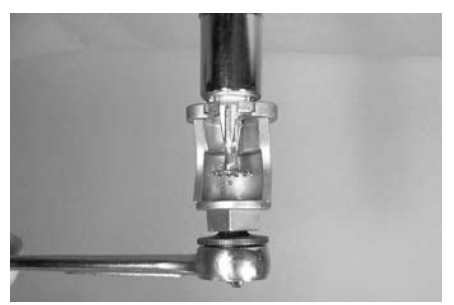
CORRECT ENGAGEMENT FOR MODEL V36 RECESSED WRENCH