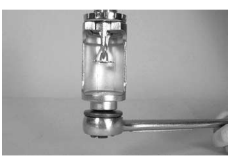
CORRECT ENGAGEMENT FOR MODEL V34 RECESSED WRENCH

Failure to follow these instructions could cause damage to sprinkler components, resulting in improper spray pattern, leakage, non-operation, and property damage.