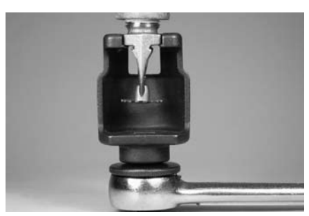
CORRECT ENGAGEMENT FOR MODEL V27-1 RECESSED WRENCH

Failure to follow these instructions could cause damage to sprinkler components, resulting in improper spray pattern, leakage, non-operation, and property damage.