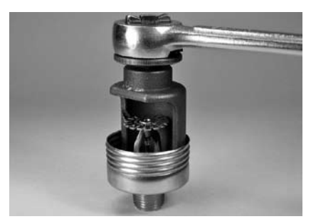
CORRECT ENGAGEMENT FOR MODEL V39 WRENCH ON V27 CONCEALED SPRINKLER