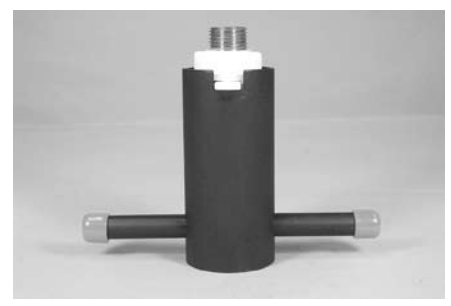
CORRECT ENGAGEMENT FOR MODEL V29 SOCKET WRENCH